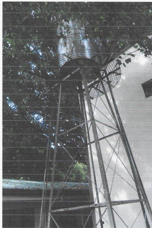
CHARLIE DEL ROSARIO WATER TANK (STUDENT CENTER BUILDING)