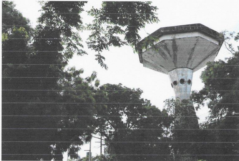
PUP MAIN WATER TANK